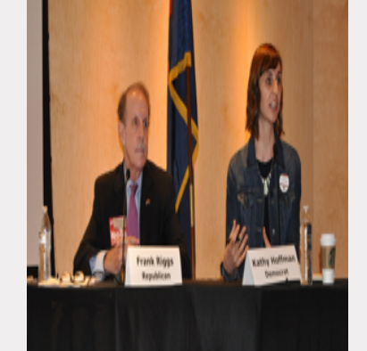
Supt. candidates disagree on how to best fund